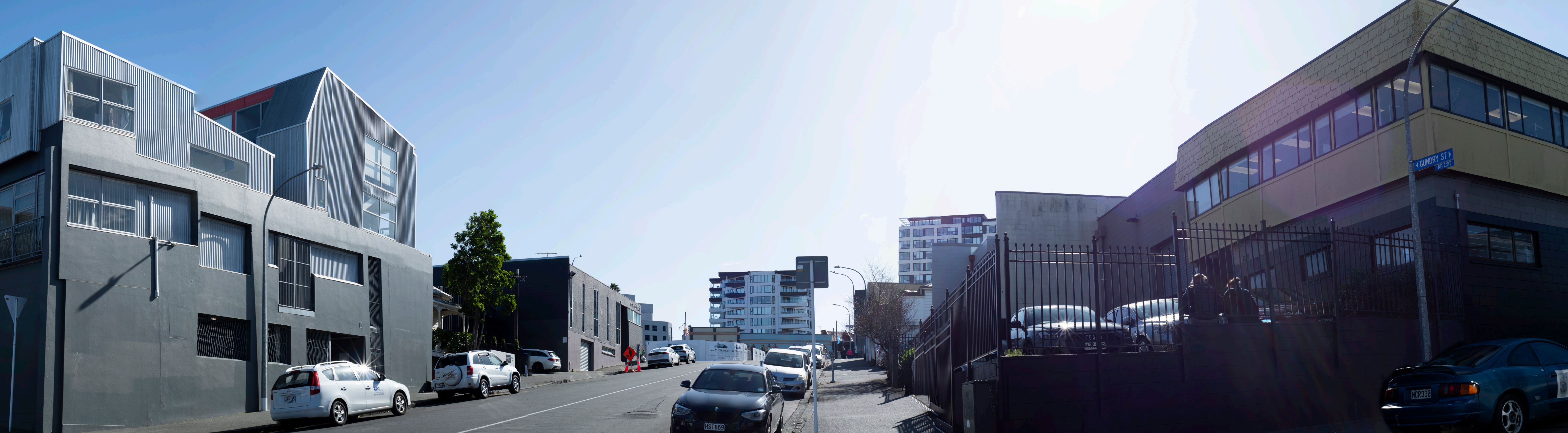
Figure 10. Viewpoint 04 - Existing.

View from Gundry Street at the intersection with Ophir Street looking north towards the site.