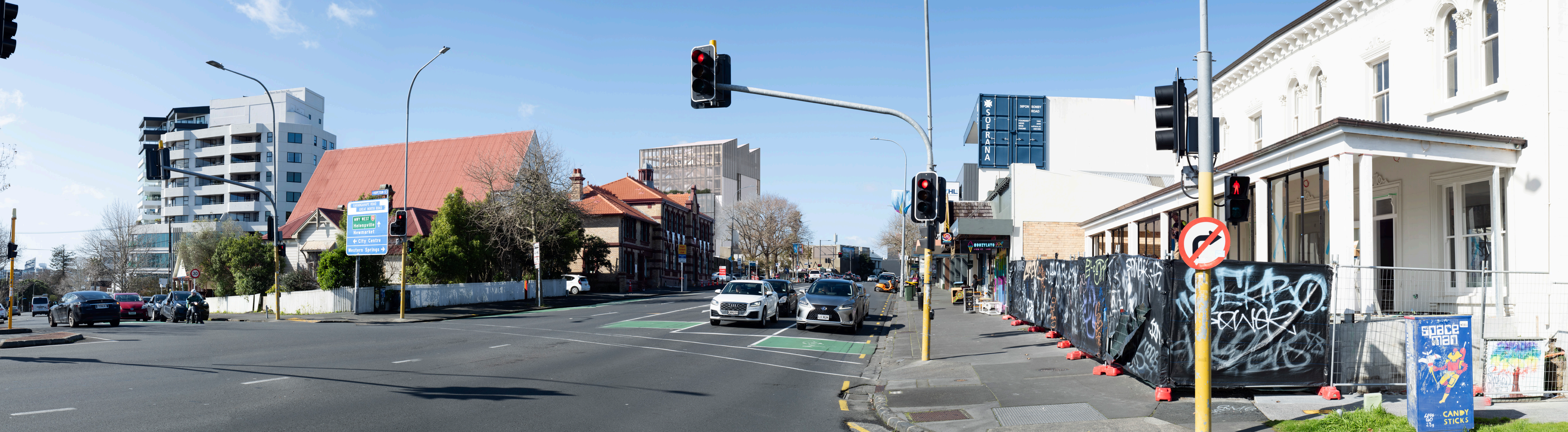
Figure 9. Viewpoint 03 - Proposed.

View from Ponsonby Road at the intersection with Crummer Road, looking southeast.