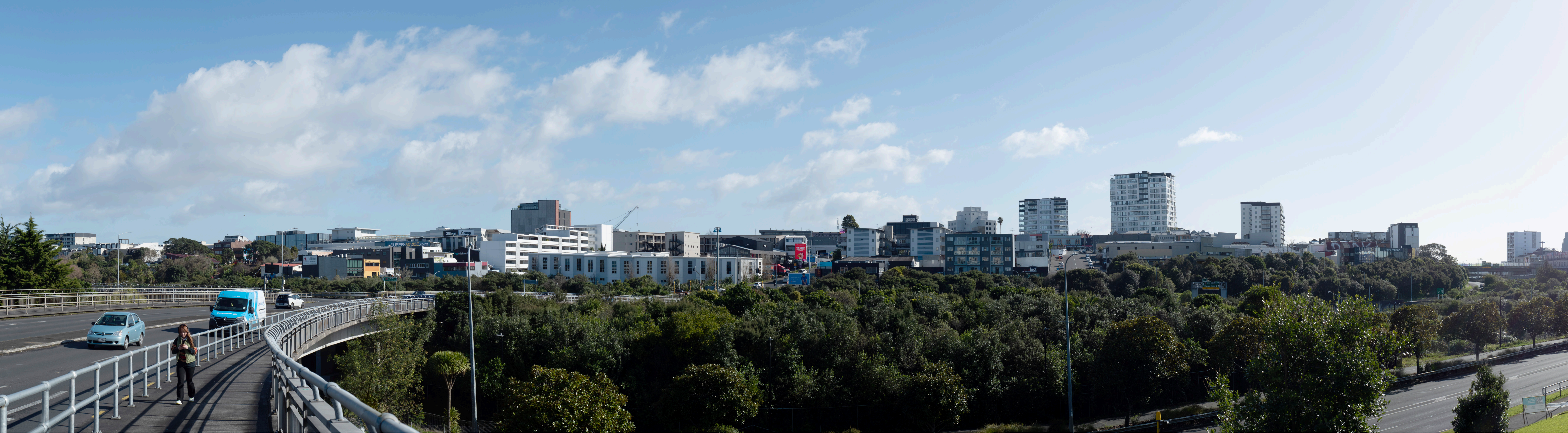
Figure 14. Viewpoint 06 - Existing.

View from the Newton Road motorway overbridge looking northeast.