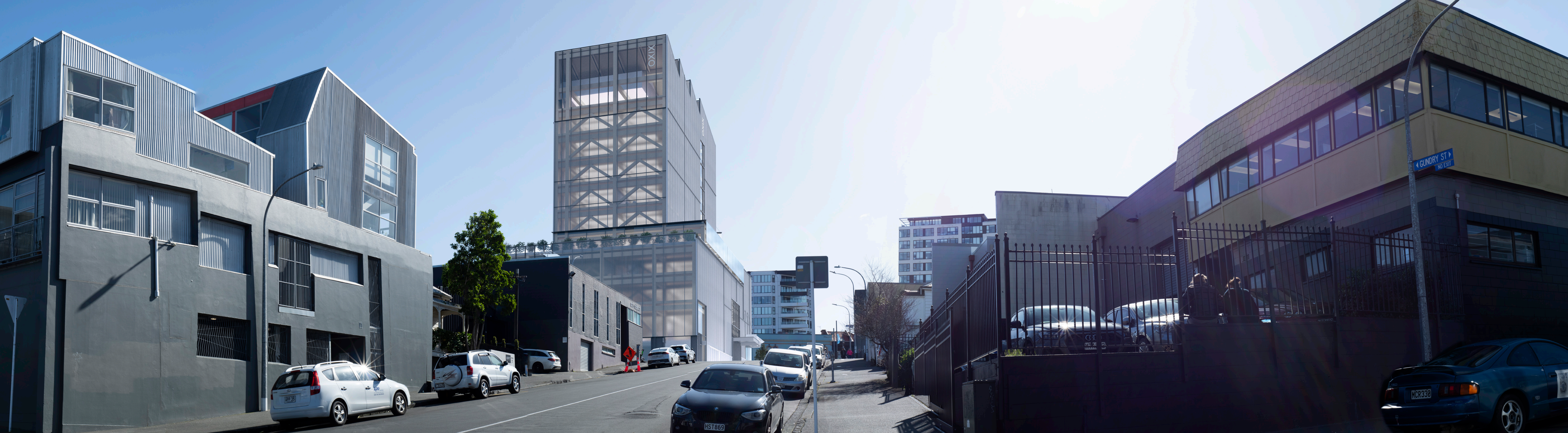
Figure 11. Viewpoint 04 - Proposed.

View from Gundry Street at the intersection with Ophir Street looking north towards the site.