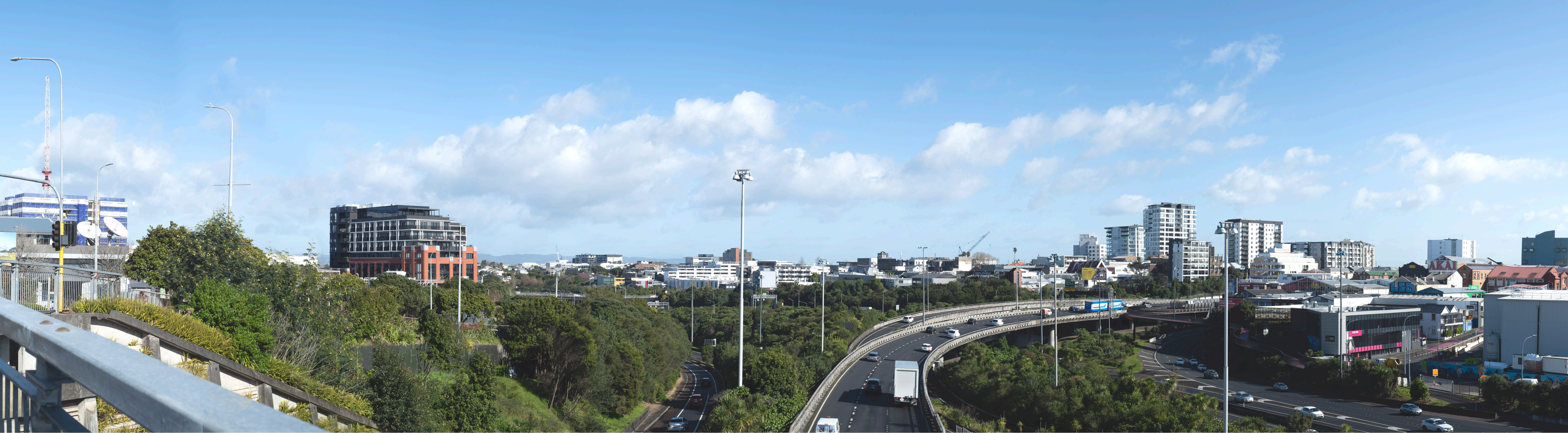
Figure 12. Viewpoint 05 - Existing.

View from Upper Queen Street motorway overbridge looking west.